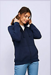
SOL'S SPIKE WOMEN 03106